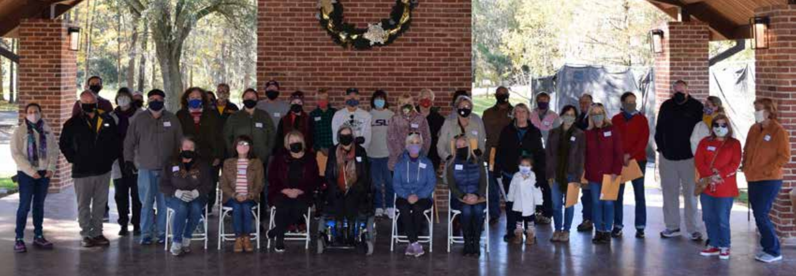
2020 graduates of the East Baton Rouge Parish Master Gardener program.